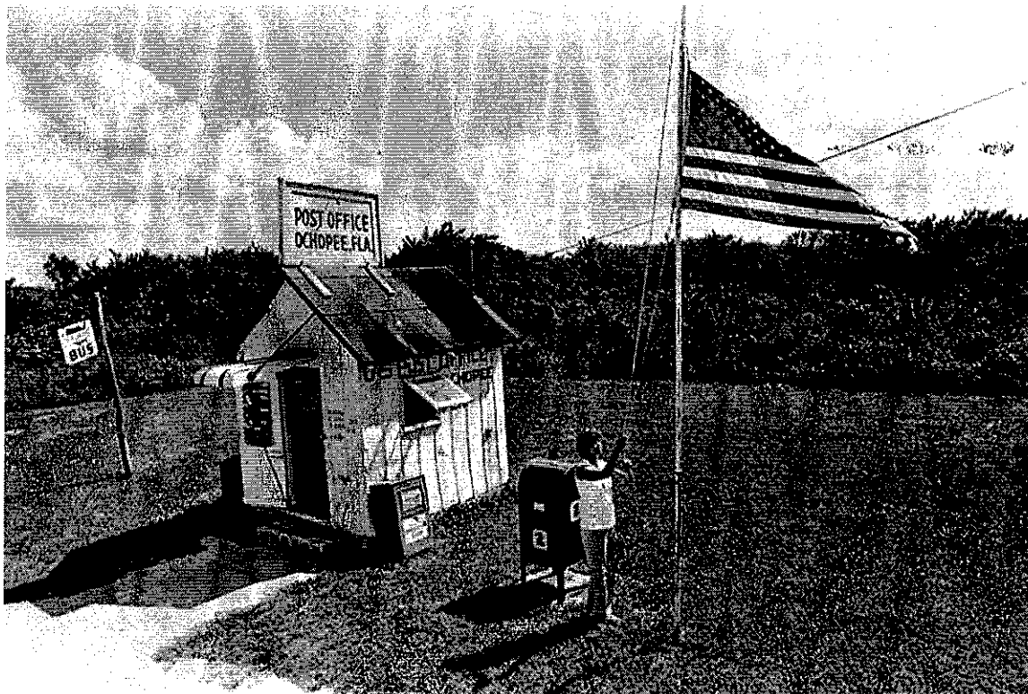
Ochopee Post Office, Florida, 1970s

The following photo, from the Web site of the United States Postal Service, shows the Ochopee Post Office, the smallest free-standing post office in the United States.